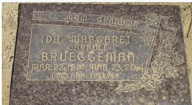
Brueggemabn Ida s43e48